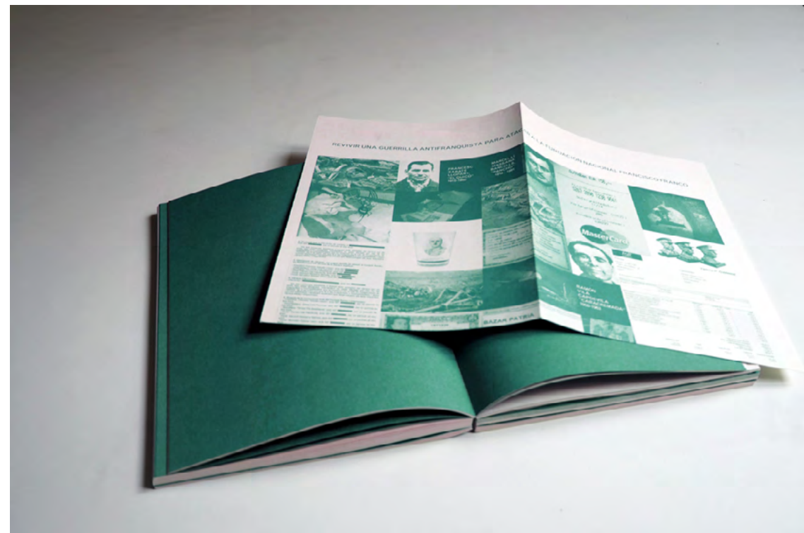
> Publication example