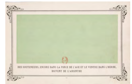
^ Alphonse Allais, Album Primo-Avrilesque , published on 1897.

The main idea is doing a series of walks through the green spaces of Santiago that I will perform dressed in green and carrying a small green painting as if it was a briefcase or handbag. I also have a green umbrella in case of rain.